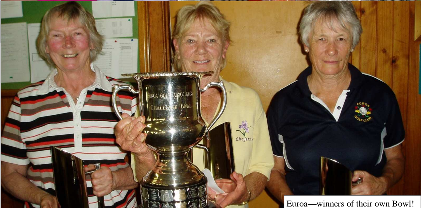
Euroa—winners of their own Bowl!