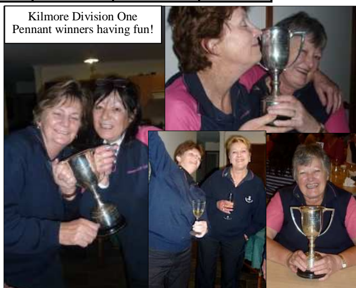
Kilmore Division One Pennant winners having fun!