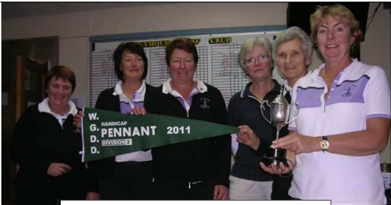
DIVISION TWO PENNANT WINNERS - WOODEND (ABOVE) DIVISION THREE PENNANT WINNERS - EILDON (BELOW)