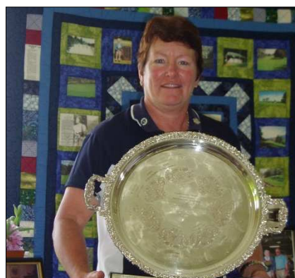
Denise wins at home at Woodend

A field of over 100 ladies and men competed in the first round of the Murrindindi Masters at Yea on December 3. Yea was complimented widely on the condition of the course. The Masters is sponsored by Foodworks and played over four courses in the Shire – Yea, Alexandra, Eildon and Marysville, over the next four months. All clubs were well represented with the Yea Ladies succeeding with Jan Wealands winning the day with 68 nett. Di Elliot was runner-up in B-grade with 70 nett.